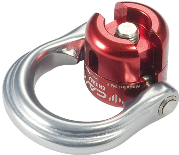
EXAMPLE OF EQUIPMENT CONNECTED DIRECTLY

ROPE ACCESS, TREE CLIMBING, TEAM RESCUE, CONFINED